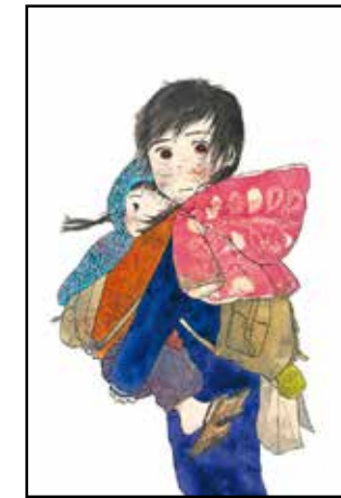
Yuki Ozawa, cover art for Atokatanomachi 3 , 2015